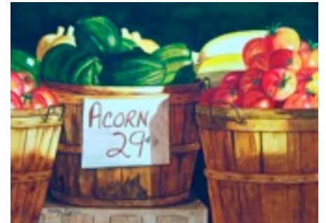
"Autumn Harvest" Kathy Byrne