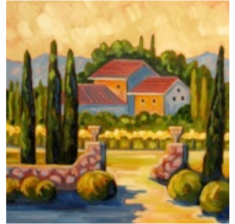
“Sonoma Villa” Penny Popken