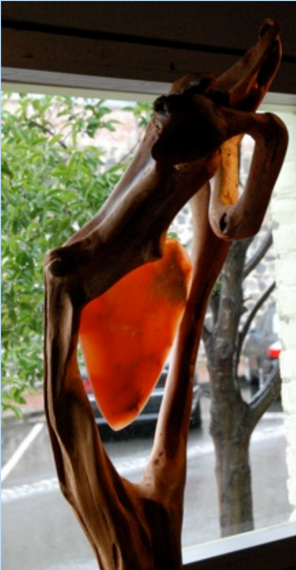
Heart of Nature, Heart of Grace