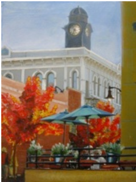
“View from Water Street” Peggy Sebera